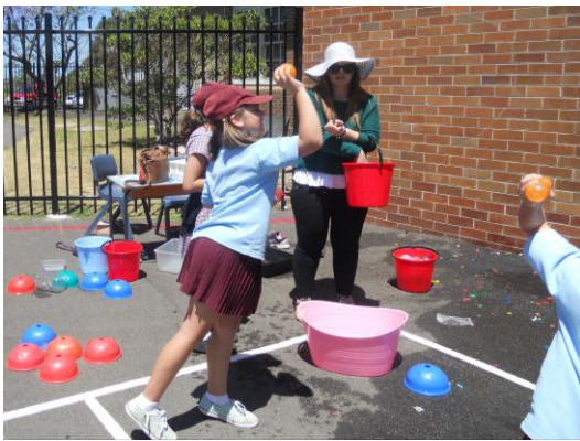
Year 6 Fun Day..... hummmm maybe too much fun?