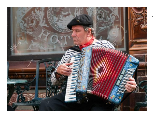
Traditional piano accordion player